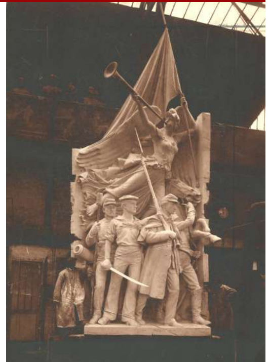
Cyrus Dallin (L) and Frederick MacMonnies (R) with The Call To Arms panel of the Soldiers and Sailors Monument, 1909

To Dallin's embarrassment, the monument was unveiled in 1910 with only one sculpture in place. The crowd of 40,000 people did not seem to mind! The second panel was completed in 1911.